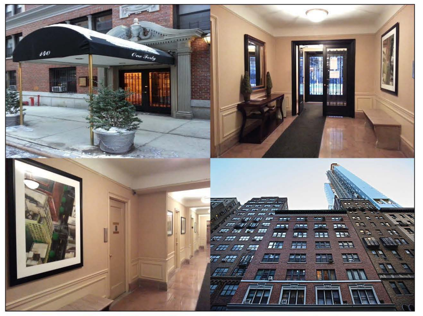
For Further Information, Please Contact