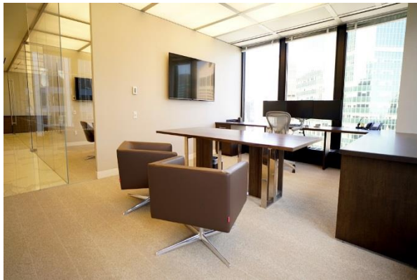
Chairman's Corner Office Picture

Exclusive Sublease Listing Perfect for Chairman's / CEO / Family Office 37 th fl. NW Corner