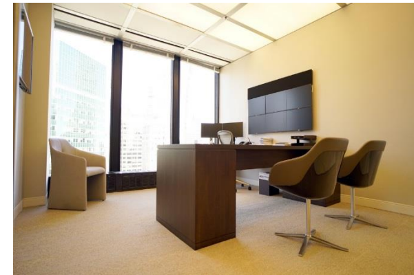
Partner's Private Office