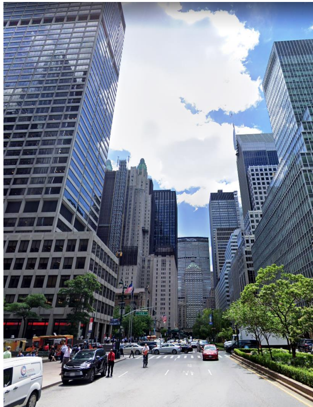
Park Avenue (Plaza District)