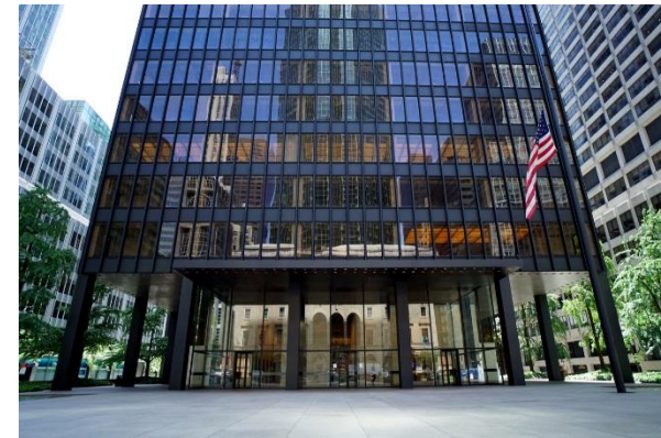
Seagram's Building Plaza