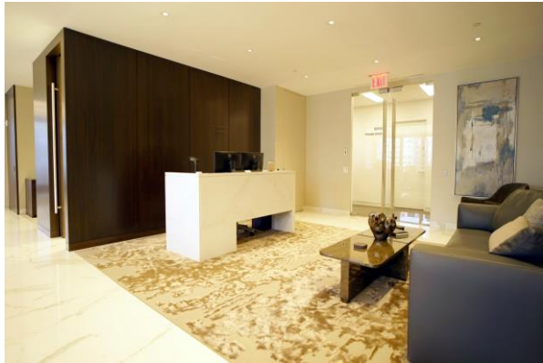
Reception with Guest Seating