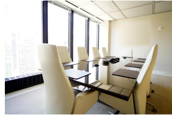
Boardroom with Unencumbered Views

This landmark building property stands 515 feet (157 m) tall, a modernist masterpiece of architecture. The property today attributes its enduring appeal to its world renown architectural features, robust infrastructure, famous fountains and plaza and the Park Avenue location.