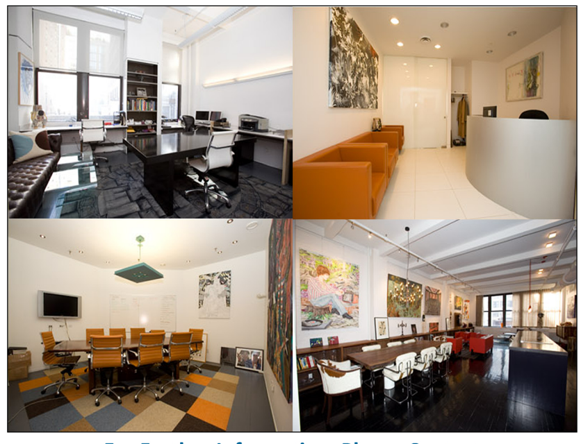
For Further Information, Please Contact