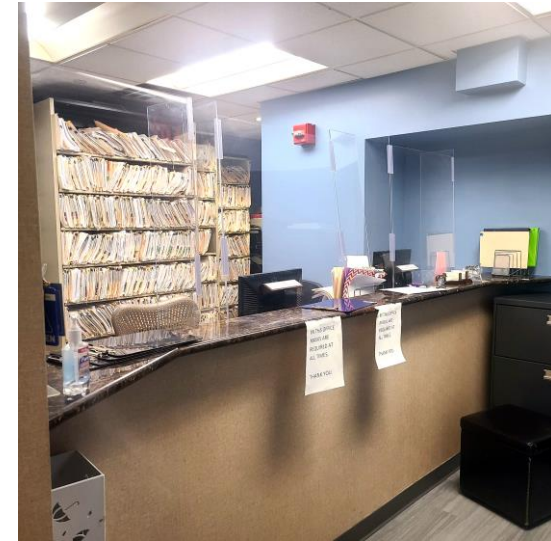
Reception Front Desk