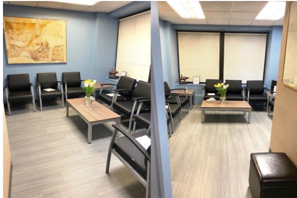
Patient Waiting Area