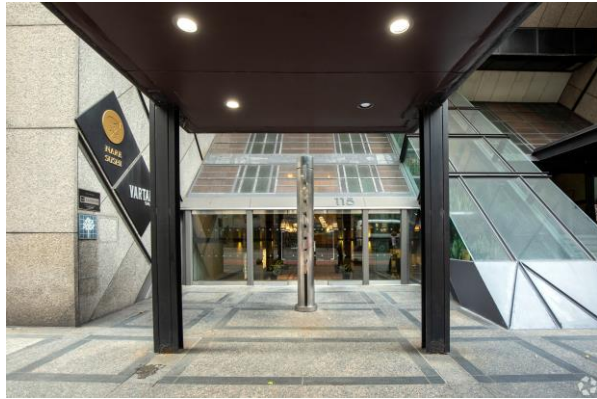
Building Property Entrance