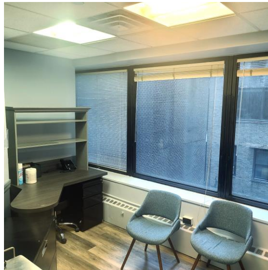
Private Windowed Office