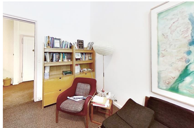
Glass Partitioned Entrance