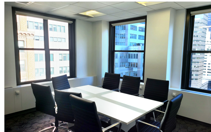
Corner Office # 4