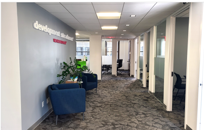
Entrance Reception Area