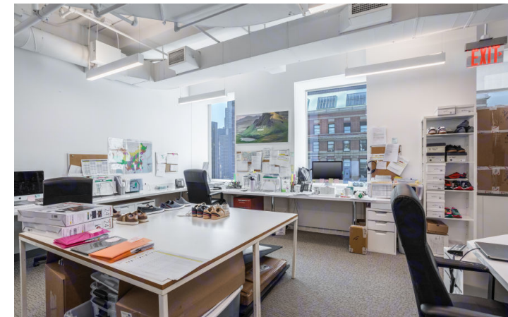
Staff Work Area