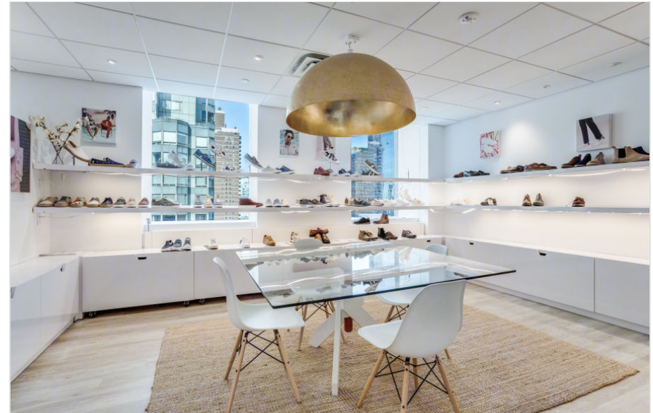
Light and Views