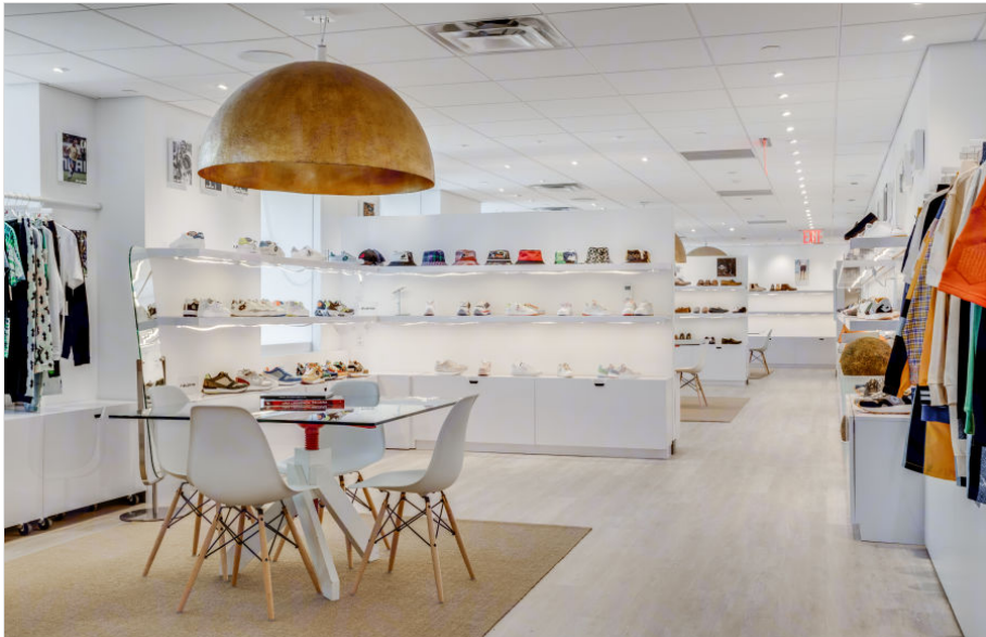
Formerly Showroom Space