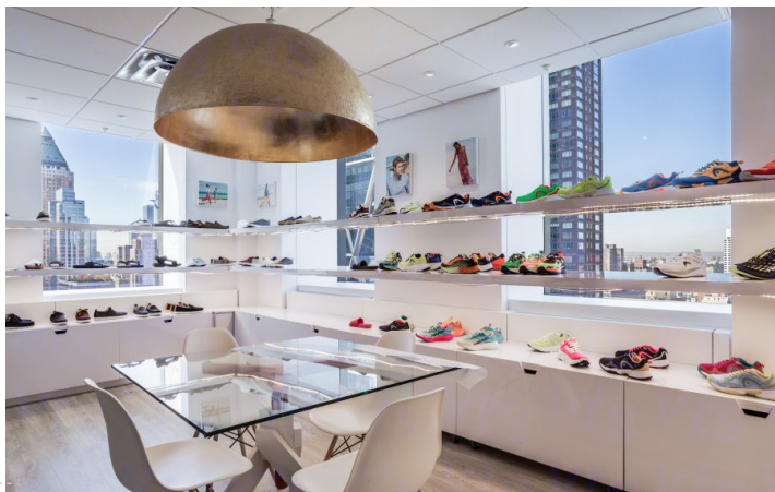
Windows at Two-Sides