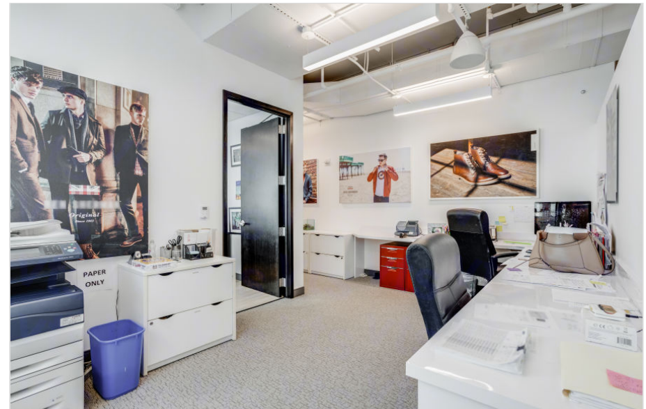
Office Work Area