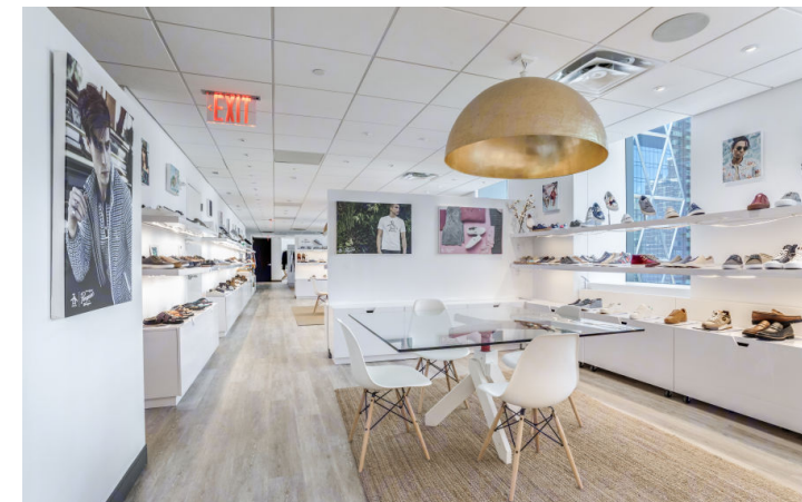
Open Work Area