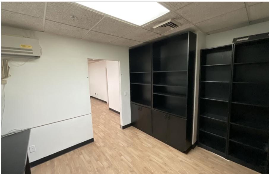
Private Office Room