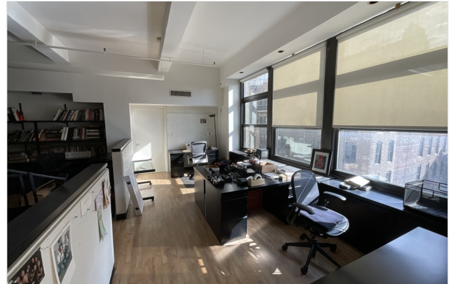
Open Work Room