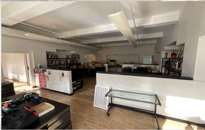
Open Work Room