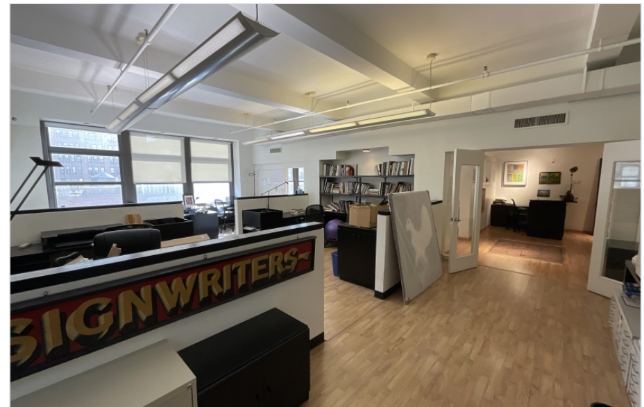
Condo Flow Perspective