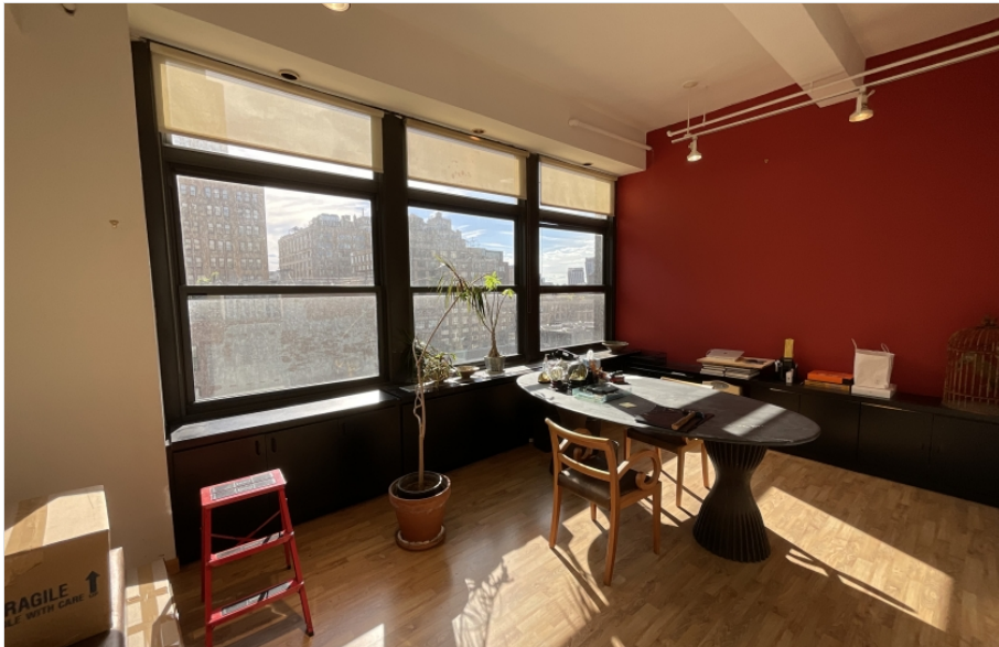
Principal's Private Office