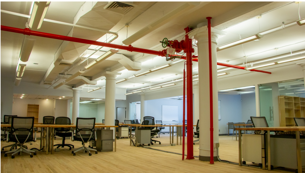
Open Loft & Glass Front Offices