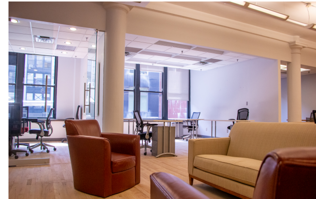
Front Loft Area

The following available commercial space offers a clean palette configured into a rectangular loft space. This rental presents a great option for those who required a new open professional space today.