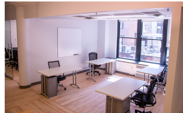
Windowed Work Area