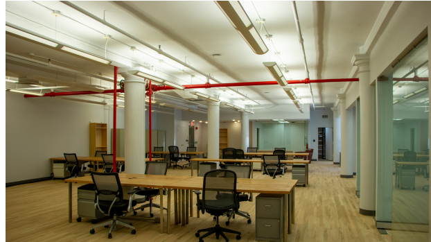
Open Work Area