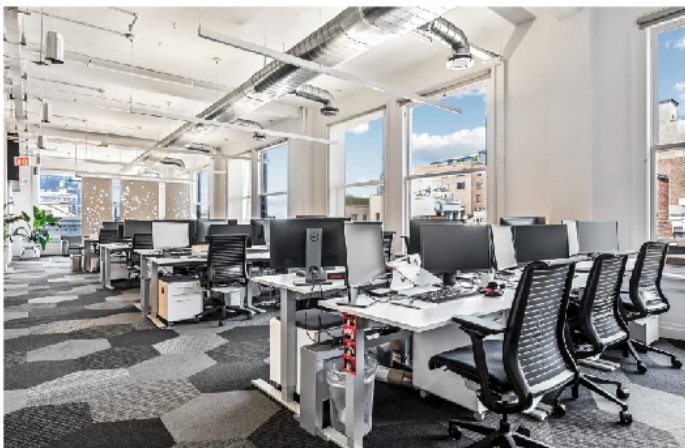
Main Work Area