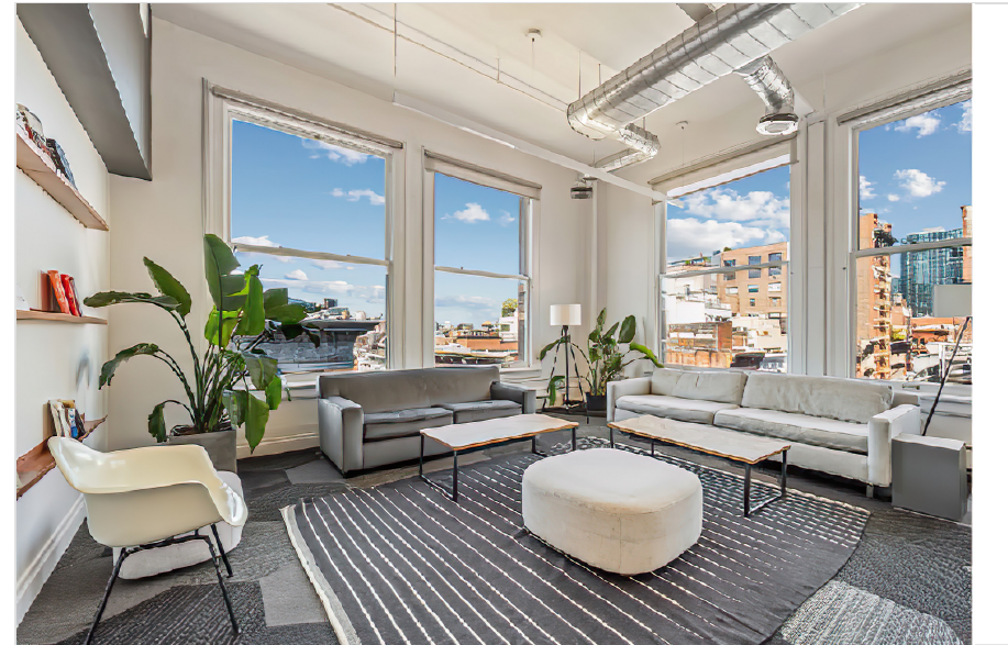
Corner End of Office