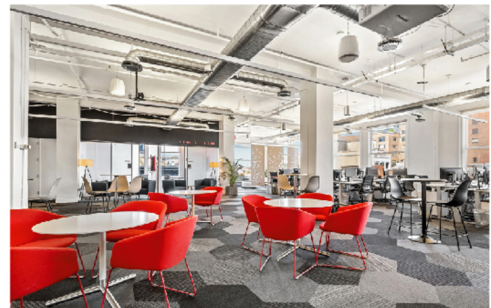
Open Layout Space