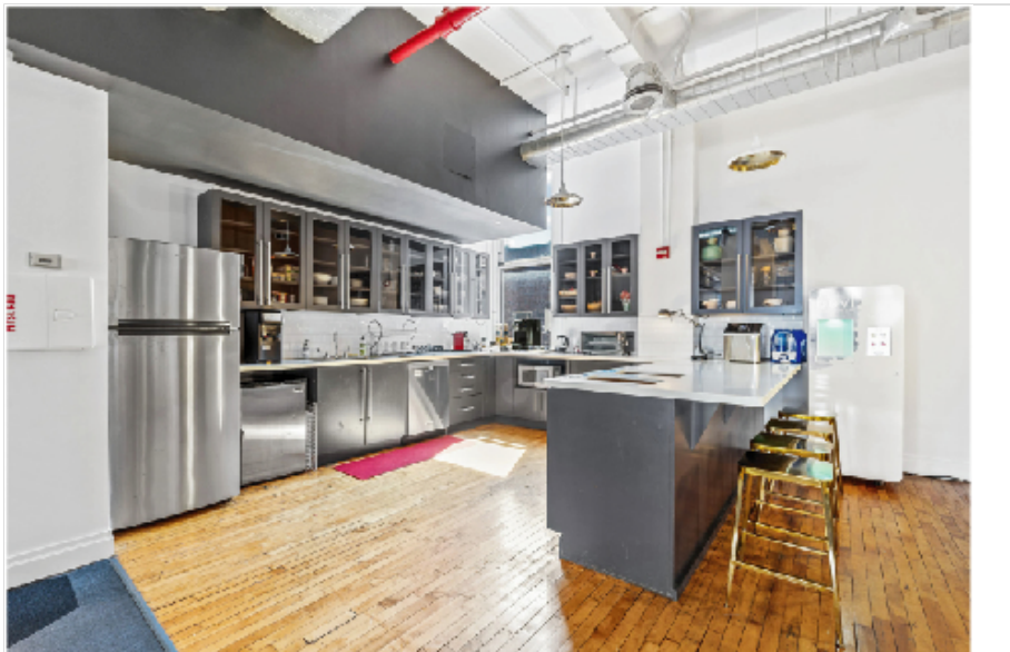
Pantry w/ Coffee Bar