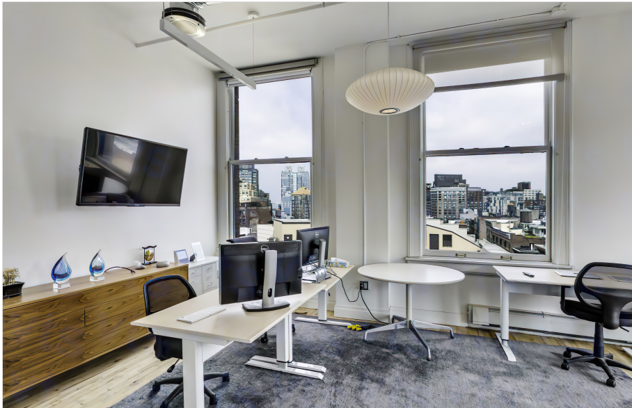
Corner End of Office